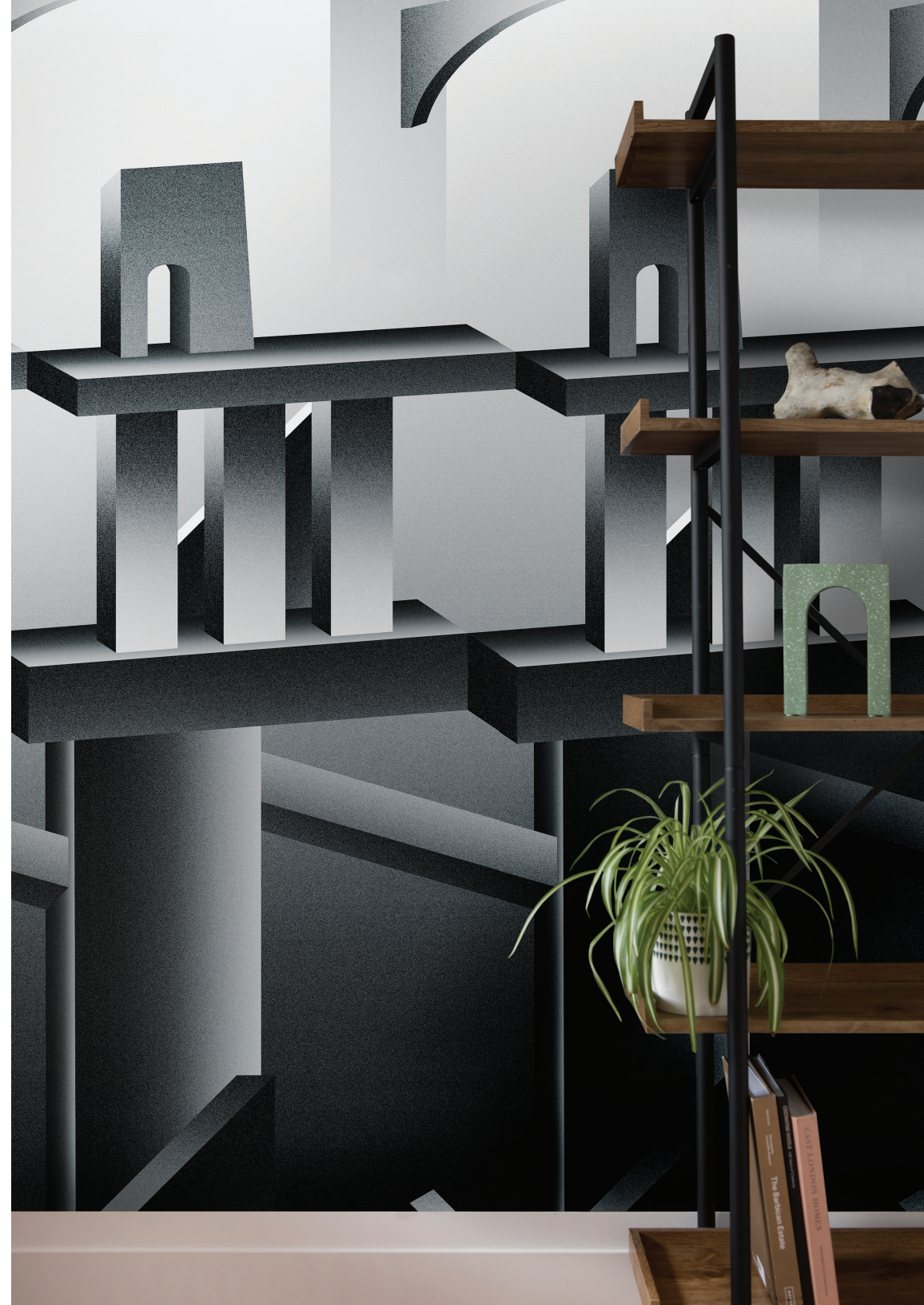
Above - Teatowel | Inset - Cushions | Right - Wallpaper