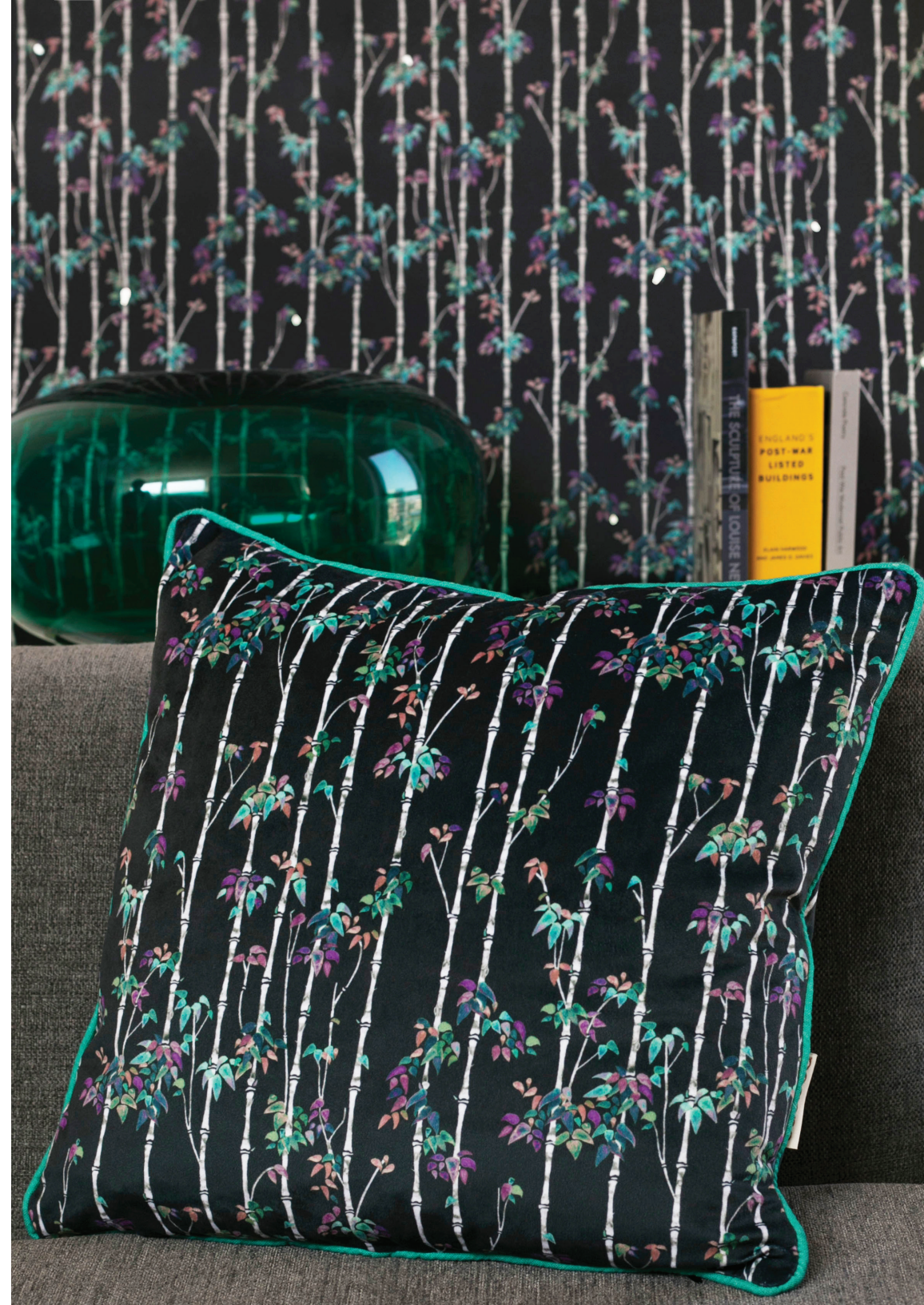
Above - Drapery fabric | Inset - Lampshade | Right - Wallpaper and velvet cushion